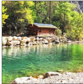
The house is _____ the river.