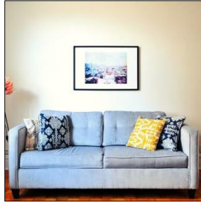
The picture is _____ the sofa.